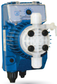
Analogue dosing pump with constant dosage Tekna AKS

Analogue dosing pump with constant flow rate, with manual adjustment by control dial on the front panel