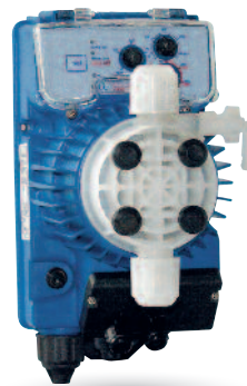
Analogue dosing pump with timed dosage Tekna ATL

Analogue dosing pump with constant flow rate, with manual adjustment and timed dosage with T ON - T OFF double regulation.