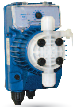
Analogue dosing pump with constant dosage Tekna AKL

Analogue dosing pump with constant flow rate, with manual adjustment by control dial on the front panel